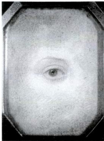
Figure 1 place of a wedding ring, Prince George sent a miniature of his own eye painted by his close

The Prince secretly proposed marriage to Maria November 3rd, 1785 in his famed letter with the postscript that read, "P.S. I send you a Parcel. . .and I send you at the same time an Eye, if you have not totally forgotten the whole countenance, I think the likeness will strike you". In